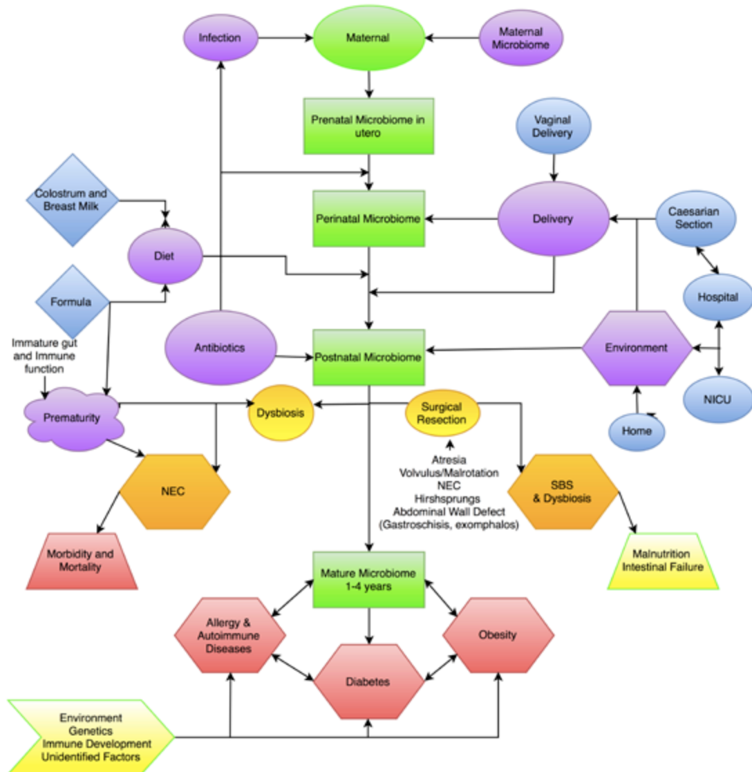
Figure 3. Influences on the Neonatal Microbiome.

that we see in NEC (McElroy et al., 2012; Neu, 2014). Whether it is a “top-down” or “bottom-up” hypothesis that occurs in coagulation necrosis at the mucosa in NEC is yet to be elucidated but a combination of both is probable (McElroy et al., 2012). Morrow et al. demonstrated that a week and <72 hours preceding a NEC diagnosis, 11 patients (Total n=35 preterm infants, <29 weeks Gestational age and <1,200 g) had an overabundance of Proteobacteria (Enterobacter and Escherichia) and decreased Firmicutes (Enterococcus and Staphylococcus) and diversity (Morrow et al., 2013). Bacteroidetes and Actinobacteria were minimally detected (Morrow et al., 2013).